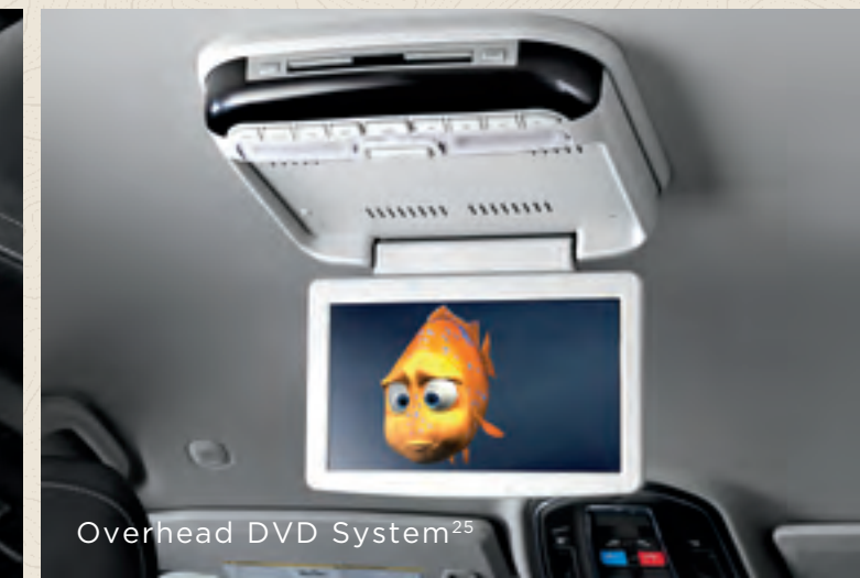
Overhead DVD System 25