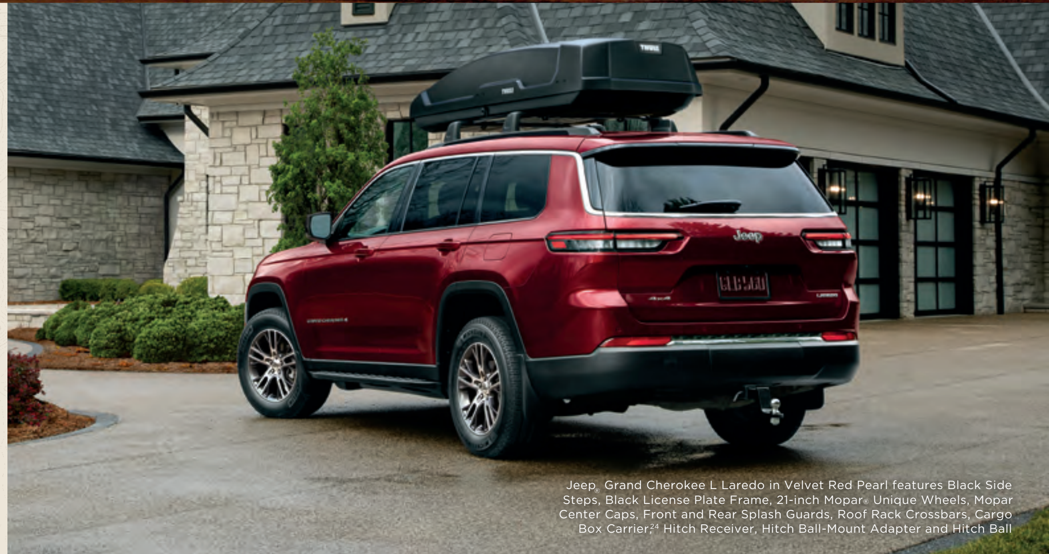
Jeep® Grand Cherokee L Laredo in Velvet Red Pearl features Black Side Steps, Black License Plate Frame, 21-inch Mopar® Unique Wheels, Mopar Center Caps, Front and Rear Splash Guards, Roof Rack Crossbars, Cargo Box Carrier, 24 Hitch Receiver, Hitch Ball-Mount Adapter and Hitch Ball