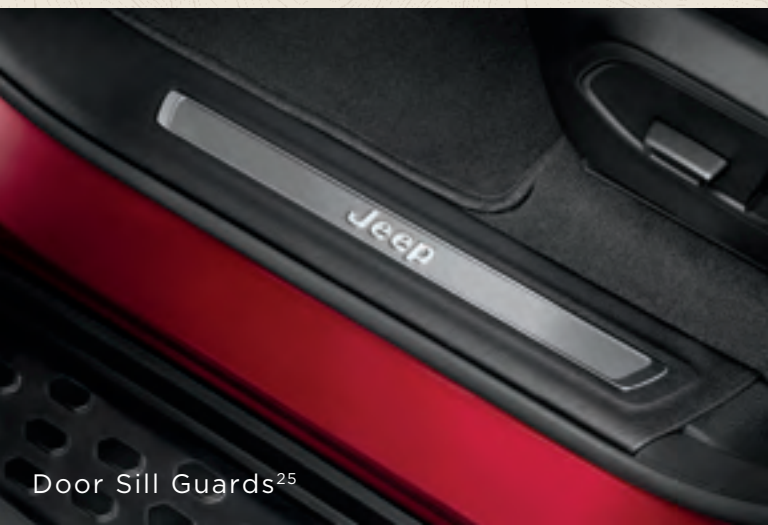
Door Sill Guards 25