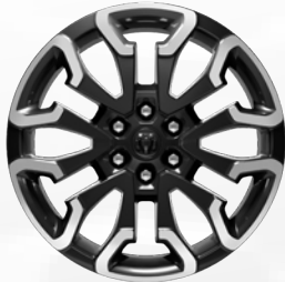
22-inch Black-Painted/Polished Aluminum Optional (WPG)