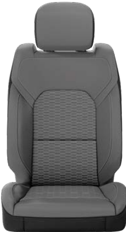
Cloth Bucket— Diesel Gray/Black Optional