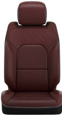
Premium Leather Quilted Bucket— Ebony Red/Black Optional