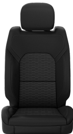
Cloth Bench— Black Optional