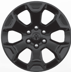
20-inch Black-Painted Black-Clad Aluminum Included with Night Edition (WRN)