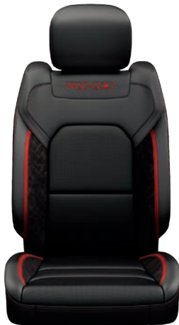
Premium Leather Bucket with Suede— Black with Red accents Optional