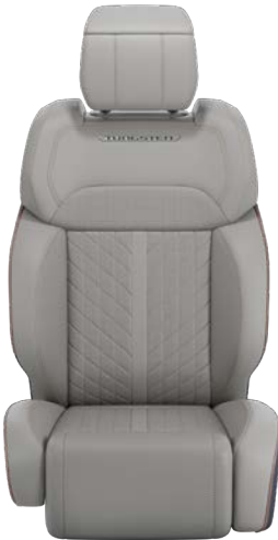
Premium Leather Quilted Bucket— Sea Salt/Indigo Standard