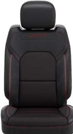
Leather-Trimmed Bucket— Black with Red Accents Included with Rebel X