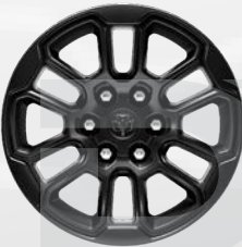
18-inch Mid-Gloss Black-Painted Aluminum Standard (WBL)