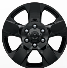
18-inch Black-Painted Aluminum Included with Night Edition (WBP)