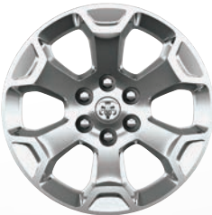
20-inch Chrome-Clad Aluminum Optional (WRK)