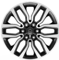
20-inch Premium-Painted/Polished Aluminum Standard (WRM)