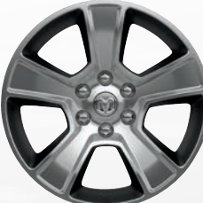
20-inch Polished/Painted Aluminum Included with Sport Appearance Package; Optional with Chrome Appearance Group (WRF)