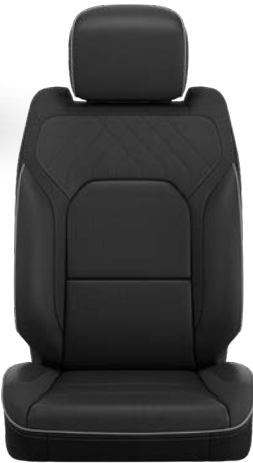
Premium Leather Quilted Bucket— Black Standard