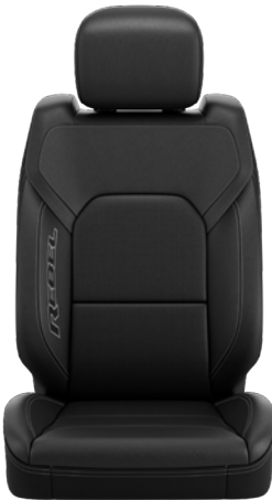
Leather-Trimmed Bucket— Black Optional