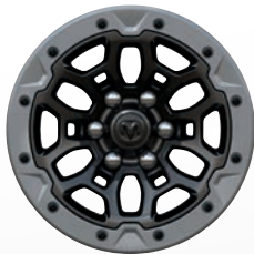
18-inch Beadlock-Capable Aluminum Optional (WS1)