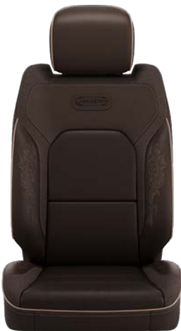
Premium Leather Bucket— Bison Brown Standard