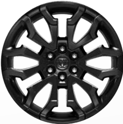
22-inch Premium Black-Painted Aluminum Included with Night Edition (WPD)