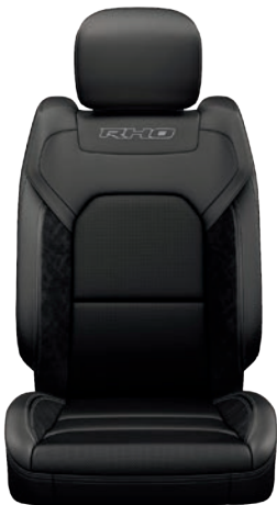
Premium Leather Bucket with Suede— Black with Gray accents Standard

Bilstein® Black Hawk® e2 adaptive shocks Class IV trailer hitch receiver 13-inch travel front suspension 14-inch travel rear suspension 6-inch increased front and rear track 33-gallon fuel tank Skid plate underbody protection Launch control Performance Drive Modes Dana 60™ rear axle with electronic locking differential Full-time BorgWarner transfer case with 4WD Auto, 4WD High and 4WD Low Uconnect Performance Pages and Off-Road Information Pages High-performance air induction system 3.92 axle ratio Electronic locking rear axle Front and rear exterior lighting animation LED pickup box lighting Remote tailgate release Selec-Speed® control Trailer Brake Controller