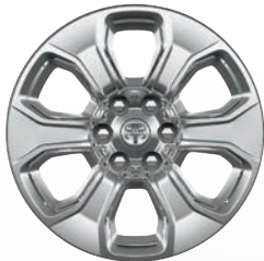
20-inch Chrome-Clad Aluminum Standard (WRD)