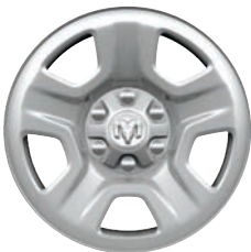
18-inch Steel Painted Standard (WBF)