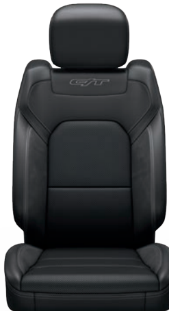
Leather-Trimmed Bucket— Black Included with G/T Package