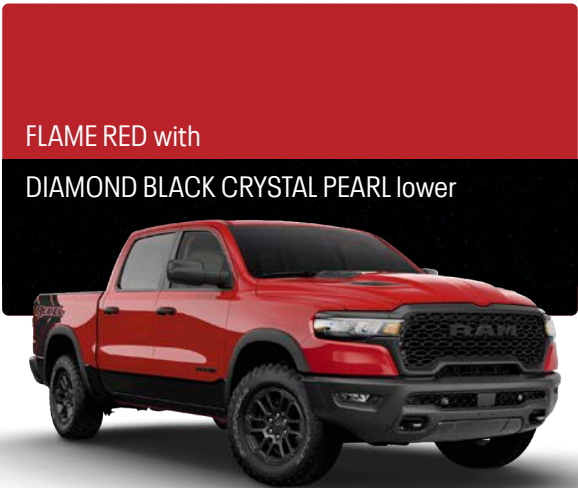
Rebel with two-tone exterior

To see examples of possible paint combinations, visit RAM.COM