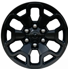
18-inch Black-Painted Aluminum Standard (WS4)