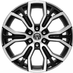
22-inch Painted/Polished Aluminum with Inserts Standard (WPA)