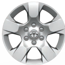
18-inch Painted Aluminum Included with Chrome Appearance Group (WBB)