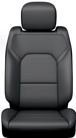
Vinyl Bench— Diesel Gray/Black Standard

6 air bags 3 including driver and front-passenger, side-curtain and front-seat side-mounted Electronic Stability Control (ESC) 4 Antilock 4-wheel disc brakes Sentry Key ® Theft Deterrent System Remote Keyless Entry Tire Pressure Monitoring System with display Tire-Fill Alert System ParkView ® Rear Back-Up Camera 5 Electronic parking brake Rear-Seat Reminder Alert Tailgate-ajar warning lamp Active Lane Management System Adaptive Cruise Control with Stop & Go 6 Auto High-Beam Headlamp Control Blind Spot Monitoring (BSM) 7 with Rear Cross Path and Trailer Detection 5 Full-Speed Forward Collision Warning Plus (FSFCCW+) 8 ParkSense ® Front/Rear Park Assist with Stop 9 Pedestrian Emergency Braking 8