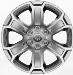
20-inch Chrome-Clad Aluminum Optional (WRH)