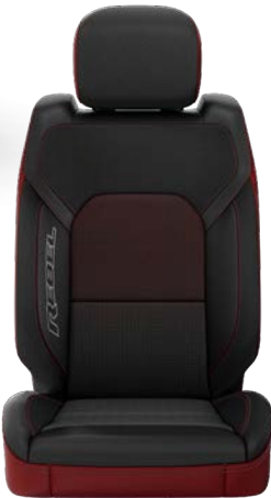
Vinyl/Cloth Bucket— Black/Dark Ruby Red Standard