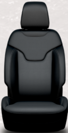
Ventilated McKinley leather-trimmed with Steel Gray accent stitching — Black /Gray and Black/Sepia (standard with Elite Group)