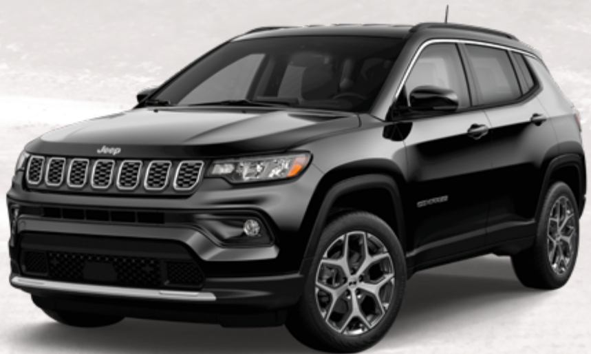
Limited in Diamond Black Crystal Pearl