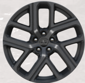
19-inch Satin Granite Crystal-painted aluminum (standard with High Altitude Package)