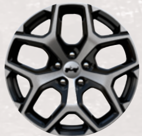
18-inch Diamond-Cut aluminum with Gloss Black pockets (standard)