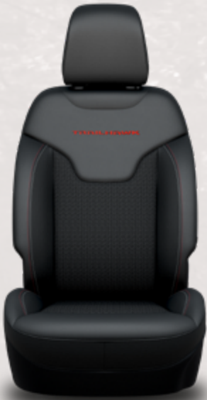
McKinley leather-trimmed and Spectre cloth with embroidered Trailhawk logo and Ruby Red and Tungsten dual accent stitching — Black (standard)