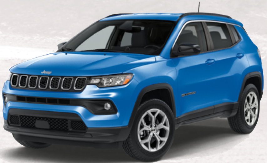
Latitude in Hydro Blue Pearl