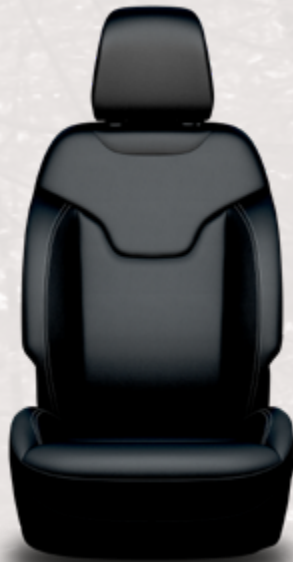
McKinley leatherette with Steel Gray accent stitching — Black/Gray and Black/Sepia (standard)