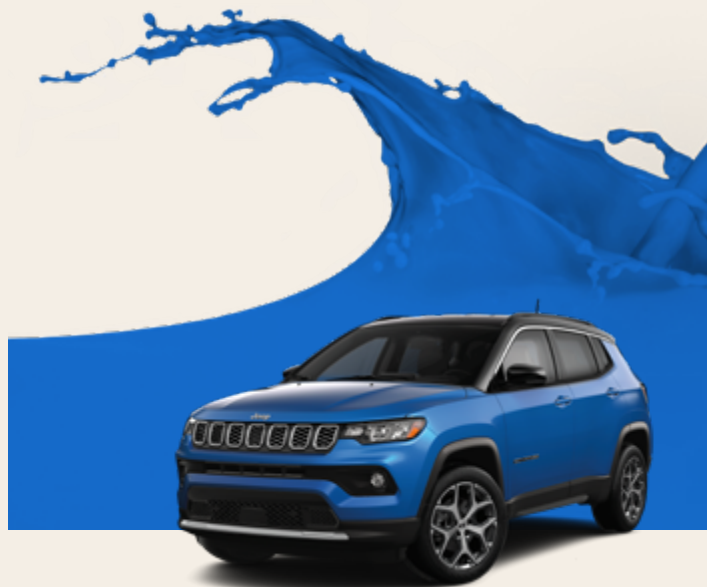
Hydro Blue Pearl