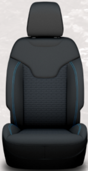
Sedoso and Kimberlite cloth with Bright Blue accent stitching — Black (standard)