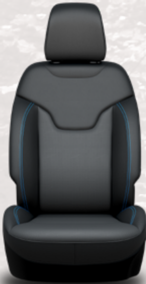
Ventilated McKinley leather-trimmed with Bright Blue accent stitching — Black /Gray (standard with Elite Interior Group High Altitude)