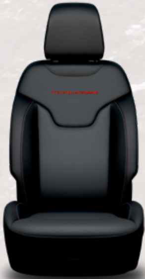
Ventilated McKinley leather-trimmed with embroidered Trailhawk logo and Ruby Red and Tungsten dual accent stitching — Black (available with Trailhawk Elite Group)