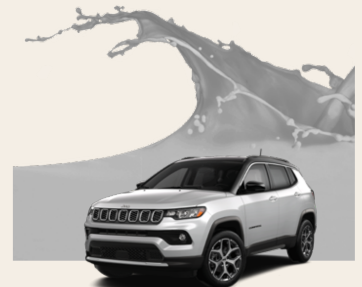
Silver Zynith Metallic