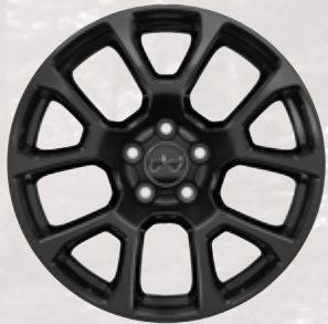
18-inch Gloss Black-painted aluminum (standard with Altitude Special Edition)