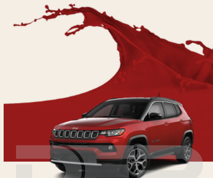
Red Hot Pearl