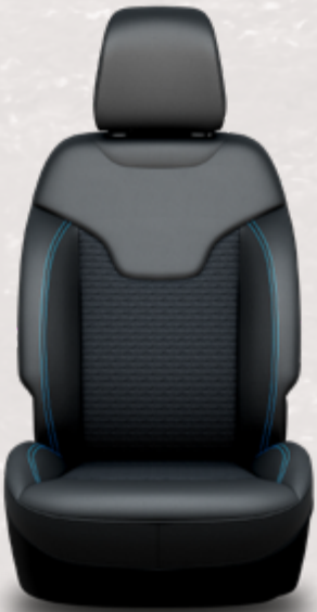
McKinley vinyl and Kimberlite cloth with Bright Blue accent stitching — Black (standard)