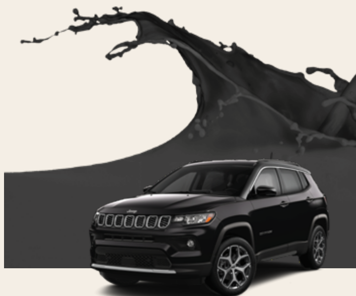
Diamond Black Crystal Pearl