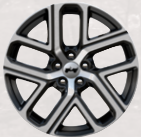
19-inch Diamond-Cut aluminum with Gloss Black pockets (standard with Elite Group)