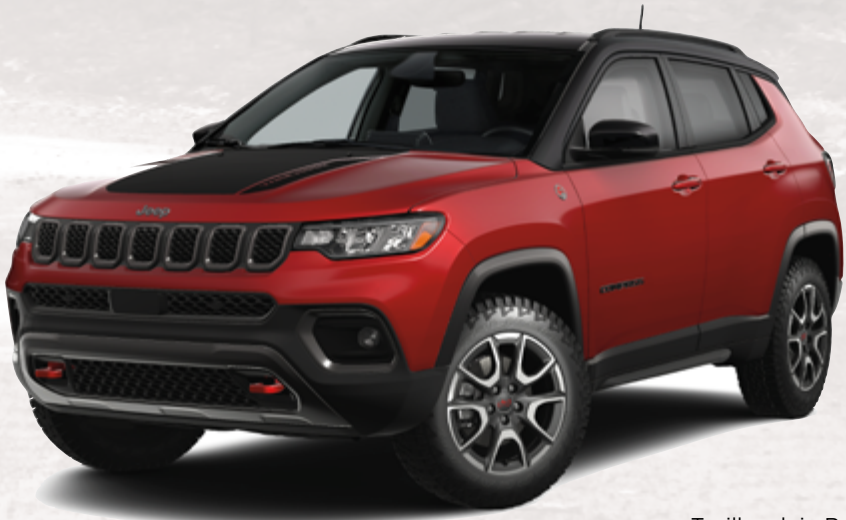
Trailhawk in Red Hot Pearl