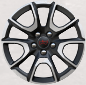
17-inch Diamond-Cut aluminum with Satin Black pockets (standard)