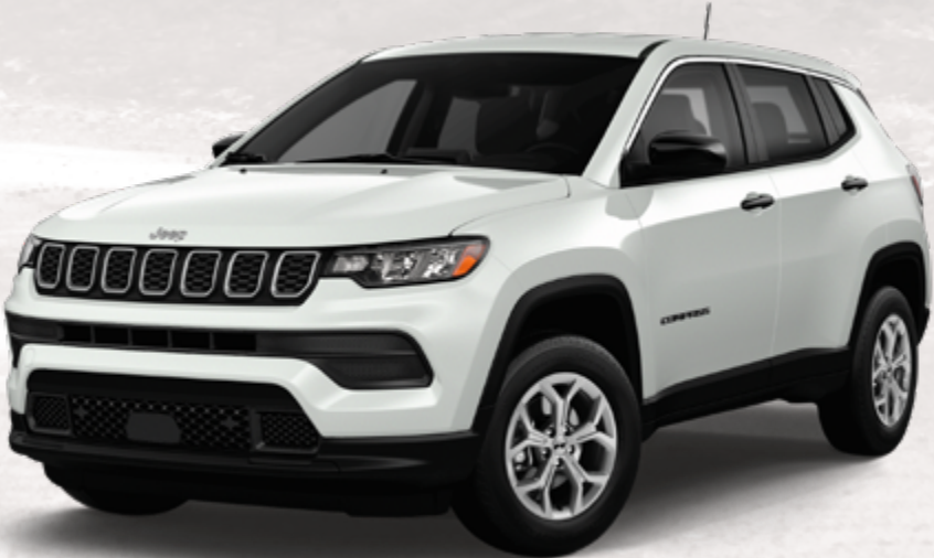
Sport in Bright White