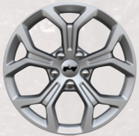
17-inch Fine Silver-painted aluminum (standard)