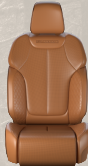
Ventilated Palermo Leather with Quilted Palermo Leather Bolsters and Cognac accent stitching, Global Black piping and embossed Summit logo — Tupelo/Black (Standard with Summit Reserve Group)