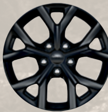
18-inch Gloss Black-painted aluminum (Standard on Altitude Package and Altitude X)