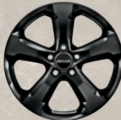
20-inch Gloss Black-painted aluminum (Available on Altitude Package and Altitude X)