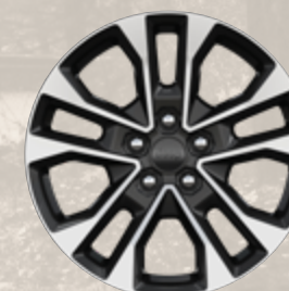
20-inch machined-face aluminum with Black Noise-painted pockets (Standard)