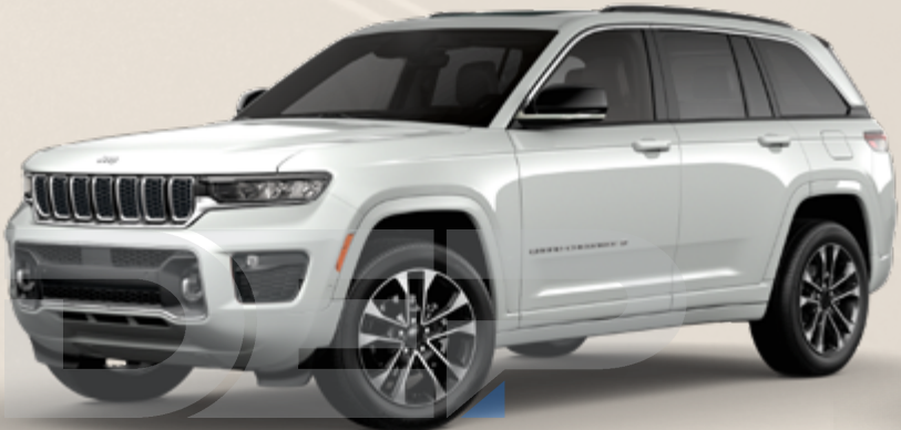
Overland® in Bright White