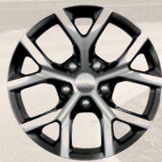
18-inch polished/painted aluminum with High-Gloss Black pockets (Standard)