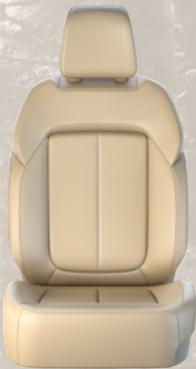
Capri Leatherette with Light Tungsten accent stitching — Global Black/Wicker Beige (Standard)