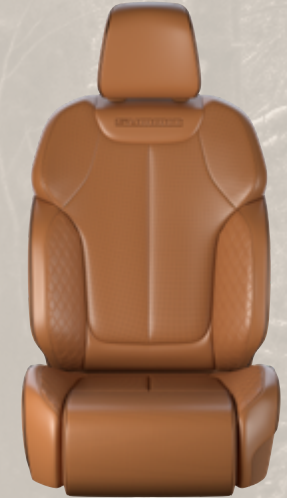
Ventilated Palermo Leather with Quilted Palermo Leather Bolsters and Cognac accent stitching, Global Black piping and embossed Summit logo — Tupelo / Black (Standard with Summit Reserve Group)