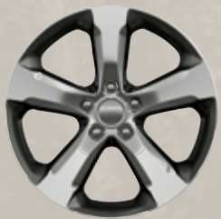
20-inch Technical Gray-painted machined aluminum (Available)