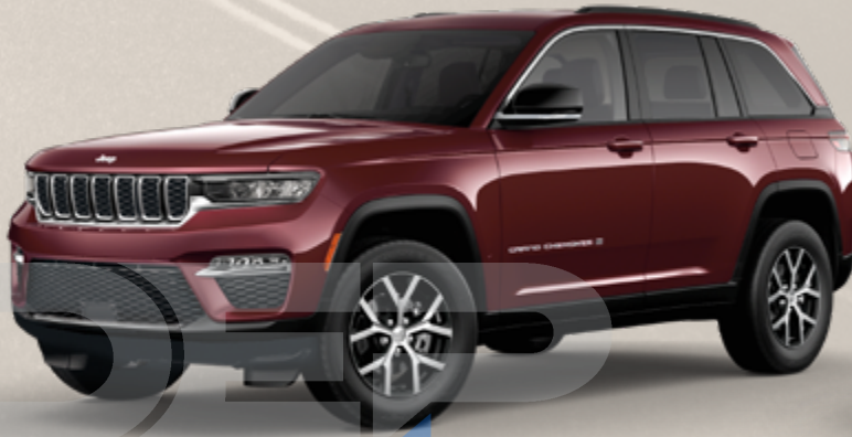
Limited in Velvet Red Pearl