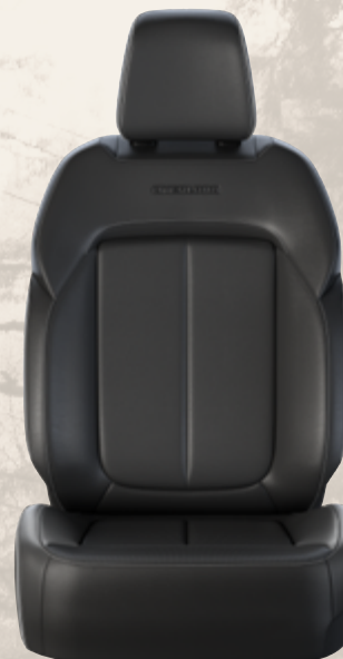
Ventilated Nappa Leather and Axis II Perforations with Light Tungsten accent stitching, Diesel Gray piping and embossed Overland logo — Global Black (Standard)