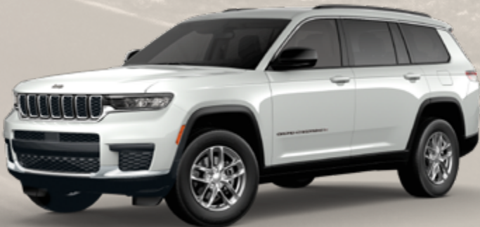
3-Row Laredo in Bright White