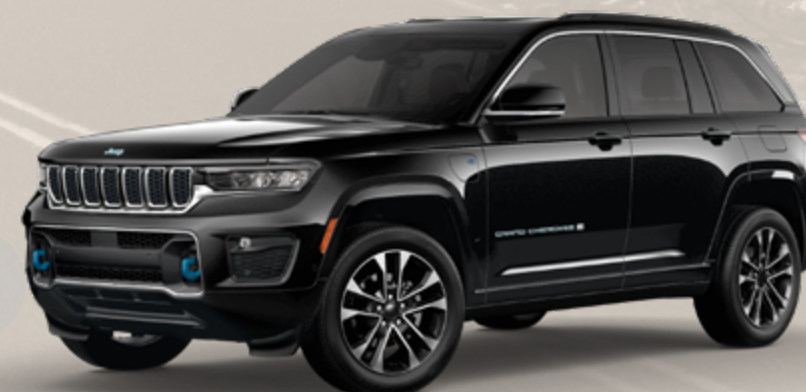
Overland® 4xe in Diamond Black Crystal Pearl