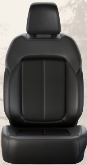
Capri Leatherette with Light Tungsten accent stitching — Global Black (Standard)