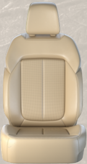
Ventilated Capri Leatherette and Axis II Perforations with Light Tungsten accent stitching — Global Black/Wicker Beige (Standard with Luxury Tech Group II)