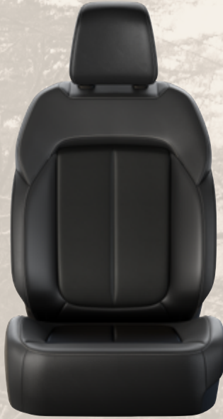
Capri Leatherette with Light Tungsten accent stitching — Global Black (Standard)