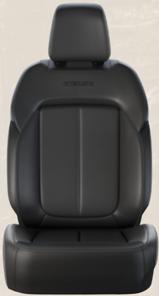
Ventilated Nappa Leather and Axis II Perforations with Light Tungsten accent stitching, Diesel Gray piping and embossed Overland logo — Global Black (Standard)