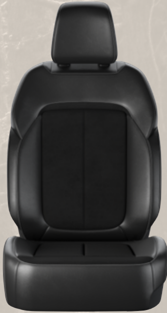
Capri Leatherette and Perforated Suede with Light Tungsten accent stitching — Global Black (Standard with Altitude X and Altitude Package)