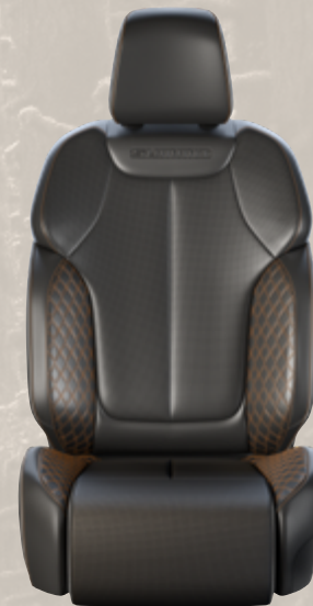
Ventilated Palermo Leather with Quilted Palermo Leather Bolsters and Cognac accent stitching, Steel Gray piping and embossed Summit logo — Global Black (Standard with Summit Reserve Group)