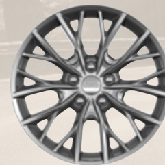
20-inch Silver Lithos fully painted aluminum (Standard)