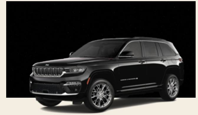
Diamond Black Crystal Pearl