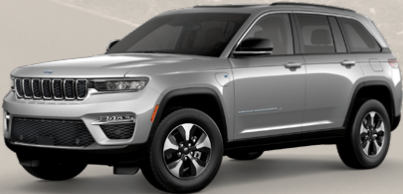
4xe in Silver Zynith