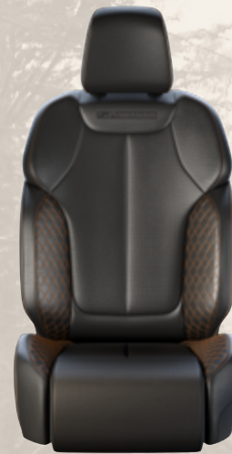
Ventilated Nappa Leather with Quilted Nappa Leather Bolsters and Cognac accent stitching, Steel Gray piping and embossed Summit logo — Global Black (Standard)