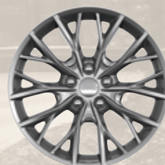
20-inch Silver Lithos fully painted aluminum (Standard)