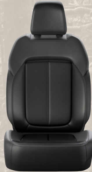
Ventilated Capri Leatherette and Axis II Perforations with Light Tungsten accent stitching — Global Black (Standard with Luxury Tech Group II)