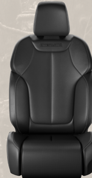
Ventilated Nappa Leather and Axis II Perforations with Light Tungsten accent stitching, Diesel Gray piping and embossed Overland logo — Global Black (Standard with Luxury Tech Group IV)