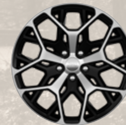
21-inch machined-face / Gloss Black-painted aluminum (Standard with Summit Reserve Group)