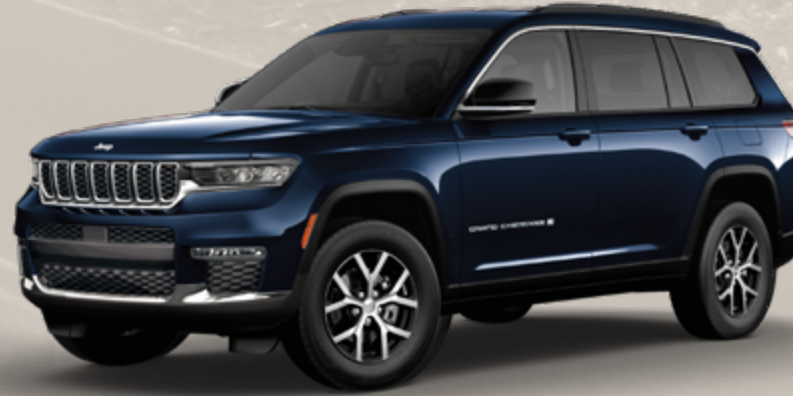
3-Row Limited in Midnight Sky