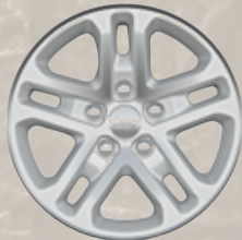
17-inch Fine Silver fully painted aluminum (Standard on 2-row models)