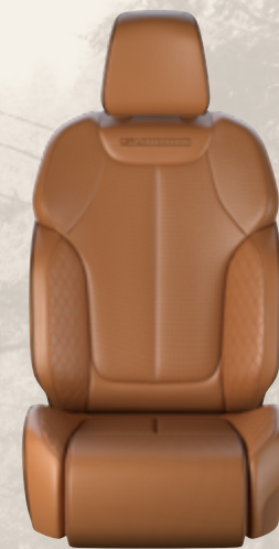
Ventilated Nappa Leather with Quilted Nappa Leather Bolsters and Cognac accent stitching, Global Black piping and embossed Summit logo — Tupelo/Black (Standard)