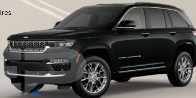
Summit in Diamond Black Crystal Pearl