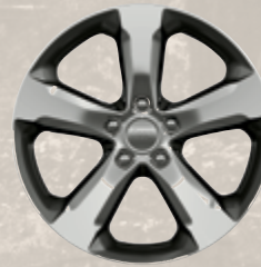
20-inch Technical Gray-painted machined aluminum (Available)