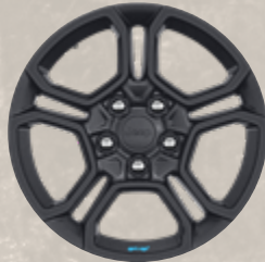
18-inch Granite Crystal fully painted aluminum (Standard with Anniversary Edition)