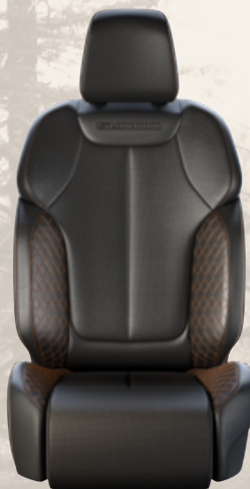
Ventilated Nappa Leather with Quilted Nappa Leather Bolsters and Cognac accent stitching, Steel Gray piping and embossed Summit logo — Global Black (Standard)