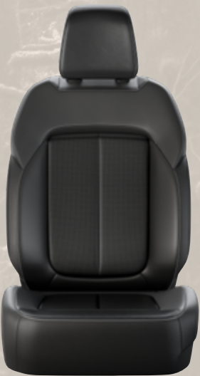
Ventilated Capri Leatherette and Axis II Perforations with Light Tungsten accent stitching — Global Black (Standard with Luxury Tech Group II and Anniversary Edition)