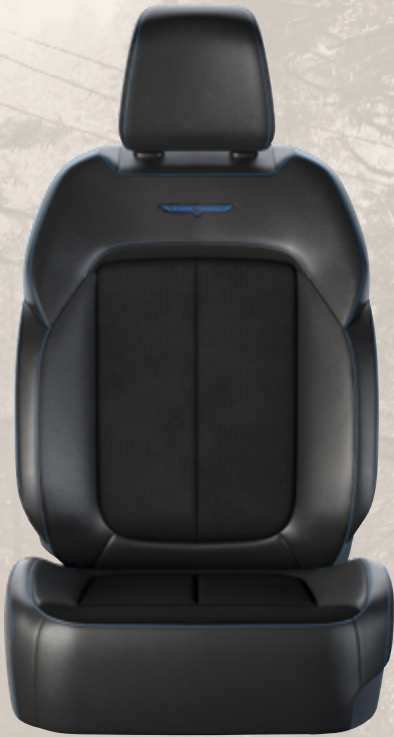
Ventilated Capri Leather and Axis II Perforated Suede with Surf Blue accent stitching — Global Black (Standard)