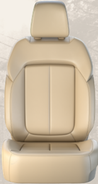
Capri Leatherette with Light Tungsten accent stitching — Global Black / Wicker Beige (Standard)