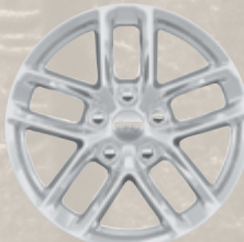
18-inch Fine Silver fully painted aluminum (Standard on 3-row models and Laredo X 2-row models; available on 2-row models)