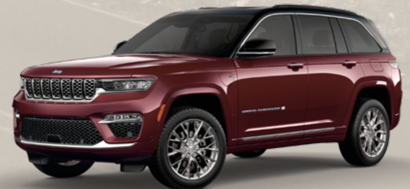
Summit 4xe in Velvet Red Pearl