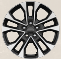
20-inch machined-face aluminum with Black Noise-painted pockets (Standard)