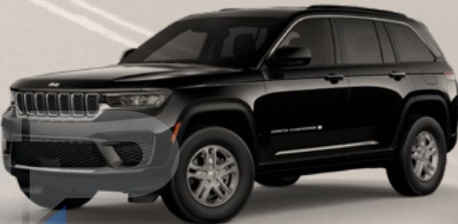
Laredo in Diamond Black Crystal Pearl