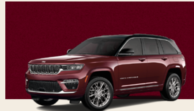
Velvet Red Pearl