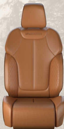
Ventilated Nappa Leather with Quilted Nappa Leather Bolsters and Cognac accent stitching, Global Black piping and embossed Summit logo — Tupelo/Black (Standard)