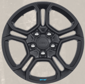
18-inch Granite Crystal fully painted aluminum (Standard)