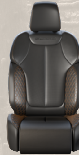
Ventilated Palermo Leather with Quilted Palermo Leather Bolsters and Cognac accent stitching, Steel Gray piping and embossed Summit logo — Global Black (Standard with Summit Reserve Group)