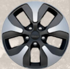
18-inch machined-face aluminum with Black Noise-painted pockets (Standard)