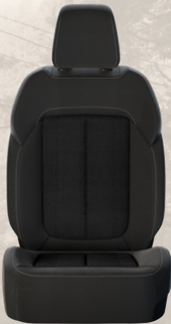
Origin and Essence Cloth with Light Tungsten accent stitching — Global Black (Standard)