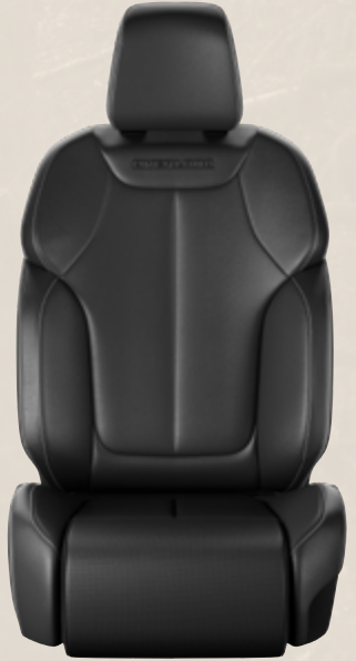
Ventilated Nappa Leather and Axis II Perforations with Light Tungsten accent stitching, Diesel Gray piping and embossed Overland logo — Global Black (Standard with Luxury Tech Group IV)