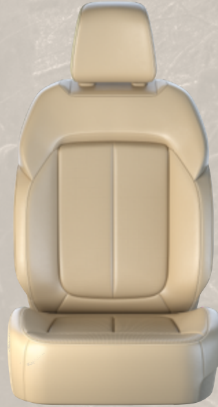
Ventilated Capri Leatherette and Axis II Perforations with Light Tungsten accent stitching — Global Black / Wicker Beige (Standard with Luxury Tech Group II)