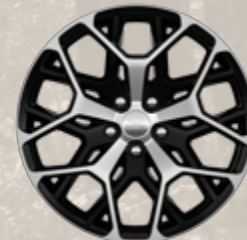
21-inch machined-face/Gloss Black-painted aluminum (Standard on 2-row with Summit Reserve Group)