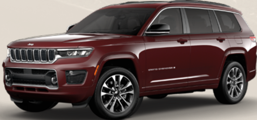
3-Row Overland in Velvet Red Pearl