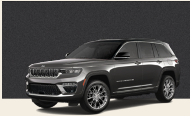
Baltic Gray Metallic