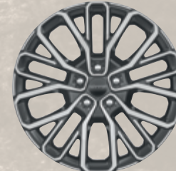
21-inch machined-face/Granite Crystal painted aluminum (Standard on 3-row with Summit Reserve Group)