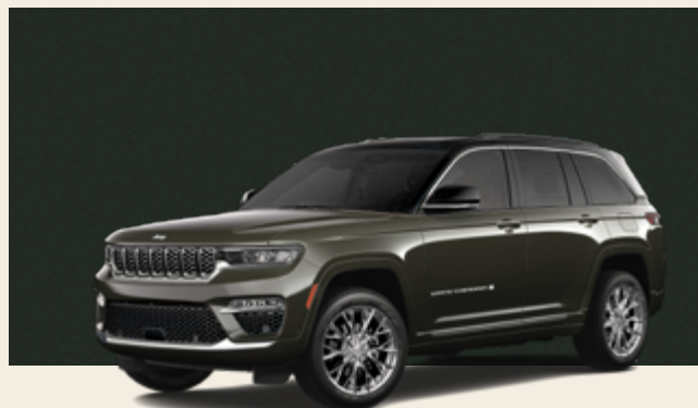
Rocky Mountain Pearl