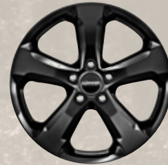
20-inch Gloss Black-painted aluminum (Standard with Black Appearance Package)