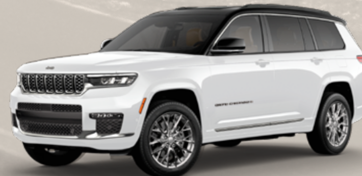
3-Row Summit in Bright White