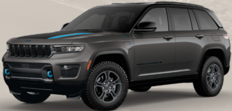
Trailhawk 4xe in Baltic Gray Metallic